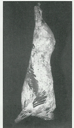
Figure 1: Dry aging of a beef carcass.

Dry aging (Figure 1) is the traditional process of placing an entire carcass or wholesale cut (without covering or packaging) in a refrigerated room for 21 to 28 days at 32-34° F and 80-85% relative humidity, with an air velocity of 0.5 to 2.5 m/sec. All three conditions, although varying widely in commercial practice, are extremely important in the proper postmortem aging of carcasses, as well as beef ribs and loins.